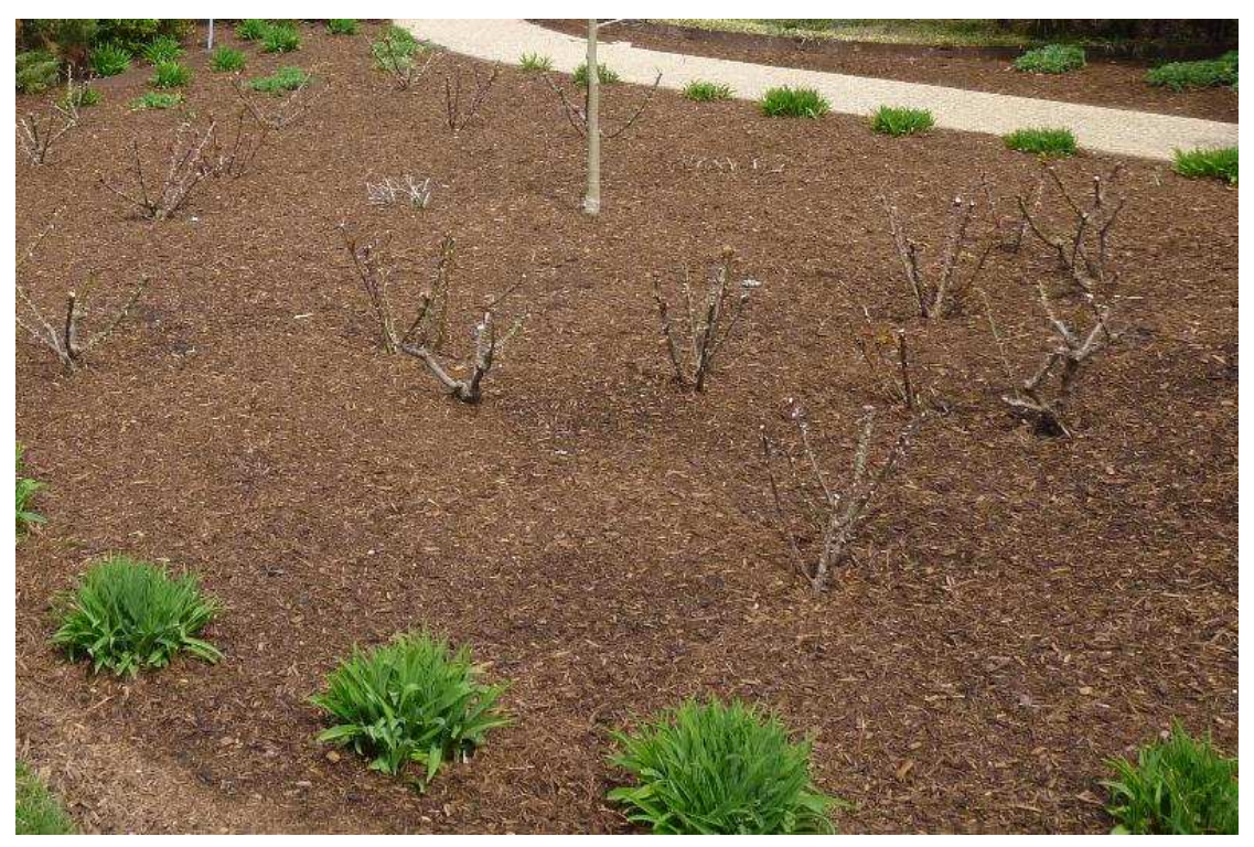
Here's a great example. We cleaned out this landscape bed, using all the steps I outlined above. We'll return in May to plant her colorful annuals that will fill in all these bare spots.

* Remove spent blooms on tulips, daffodils and other spring flowering bulbs. The plant will put all of its energy into growing new bulbs. Leave the leaves! Leaves are needed to form new bulbs so don't pick them off. They'll die and fall off the plant in early summer.