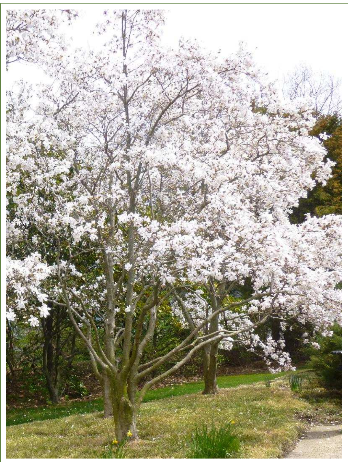
Here are some more trees on this same property. It looked like a cherry blossom festival, right here in St. Michaels.

I'm so fortunate. My job allows me to be on many of your beautiful properties. The "view from my office window" changes every day. Can you tell I really love my job?