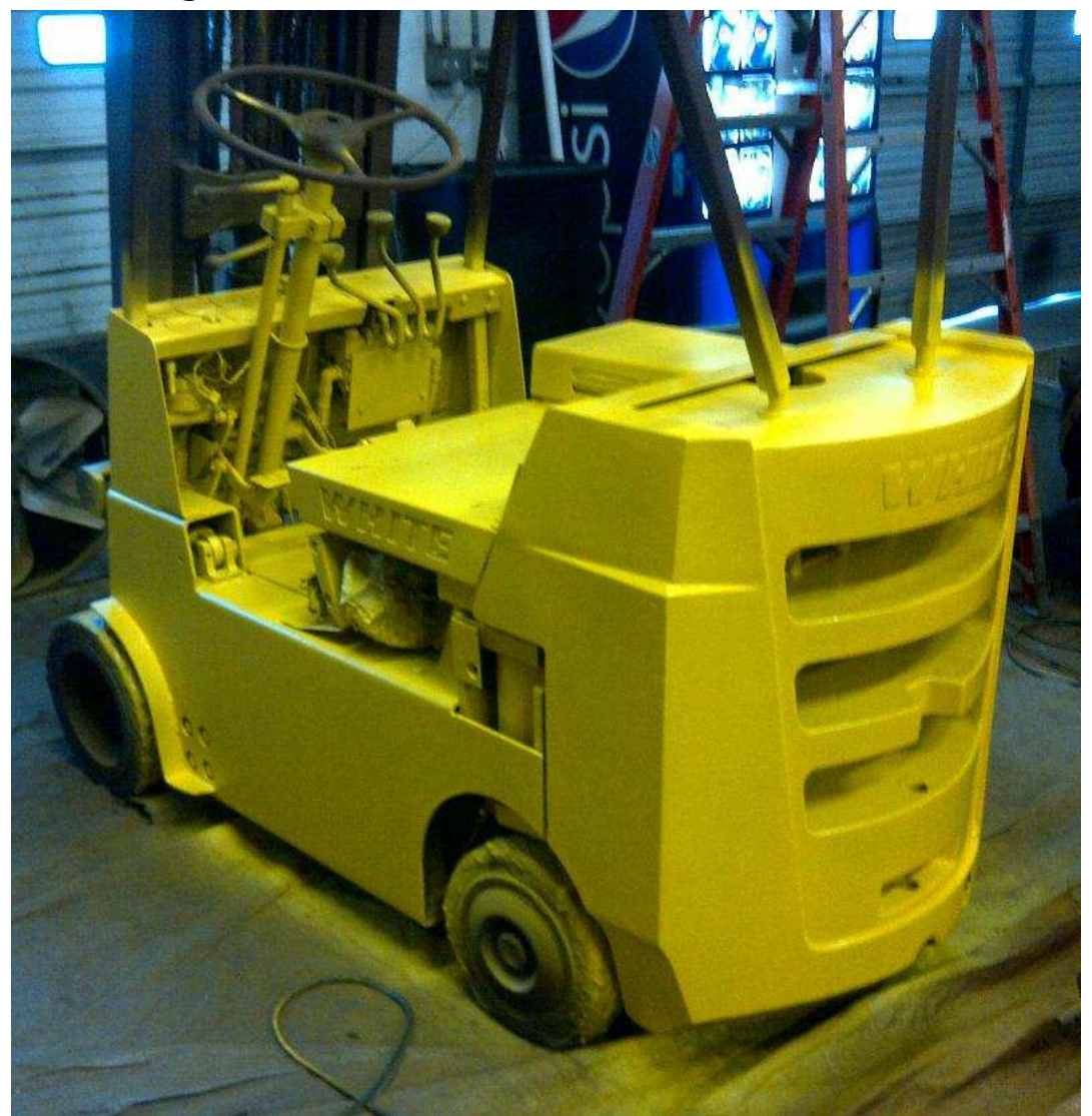
Here's the first stage of painting. It's called "Safety Yellow."

Finally, I'll go back over the forklift to paint the graphics with a bright red.