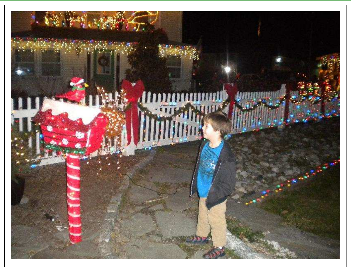
A young visitor loves our mailbox that open and closes. A special "Letter to Santa" magically appears as the box opens.