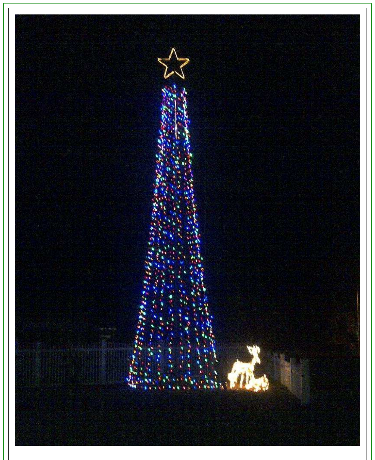
Here's our 36 foot custom-made Christmas tree. It towers over the entire winter wonderland. You can see it from the road, as you drive by our offices.

We hope you enjoyed our tribute to the Christmas Season. Thanks to everyone for the calls, emails and notes that you've sent, thanking us for the display. We appreciate hearing from you. Thank you for a great season. It was our pleasure to assist you with your landscaping needs in 2012.