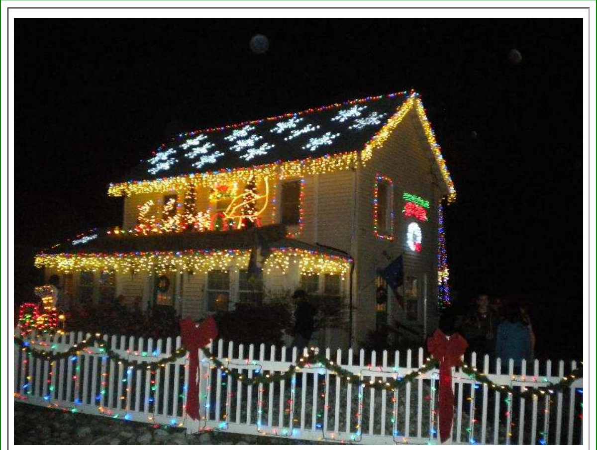
Here's a picture of our offices as the lights go on for the first time. This was Thanksgiving night. Lots of our neighbors joined us for pictures and cookies.