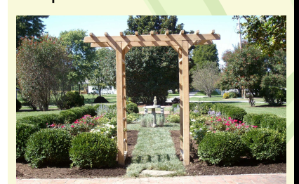
This garden was built over a filled-in pool in St. Michaels.

* Can we offer you some assistance with a fresh look for your landscaping this spring? Sometimes, you may just need a little advice. Other situations call for a full scale landscape design. We can help you with both. Give us a call so that we can meet with you to evaluate your outdoor look. Take a look at our website for both small and large scale plans we've completed.